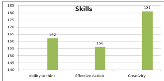
Fig. 3. Needed of construction industry for skill graduates

(score 156). Creativity characterized by the ability of workers around the limitations that occur in work. Many limitations in construction are due to the late material, weather, equipment and human resources.