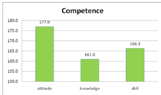
Fig. 4. Needed of construction industry for skill graduates

The industry needs main competence of graduates is the attitude. The score of three variables is represented in Figure 4.