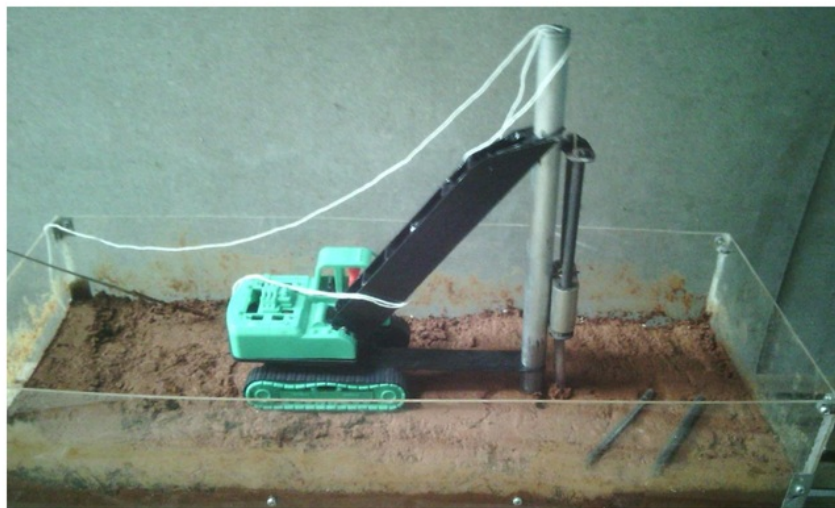
Figure 3. Piling Process Prototype Model

The learning model is applied to the class by the number of students by 30 participants with stage: