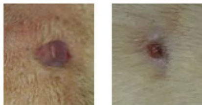
FIGURE 2. Representative images of dorsal excision skin wounds treated with EE, EAE, povidone iodine (positive control) and base gel (negative control) for 15 days.