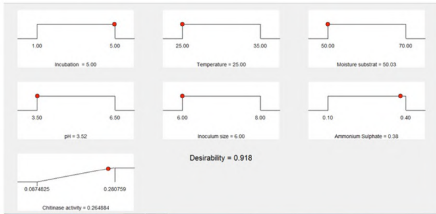
FIGURE 2. Predicted optimum levels of the six independent variables indicating the highest production of chitinase