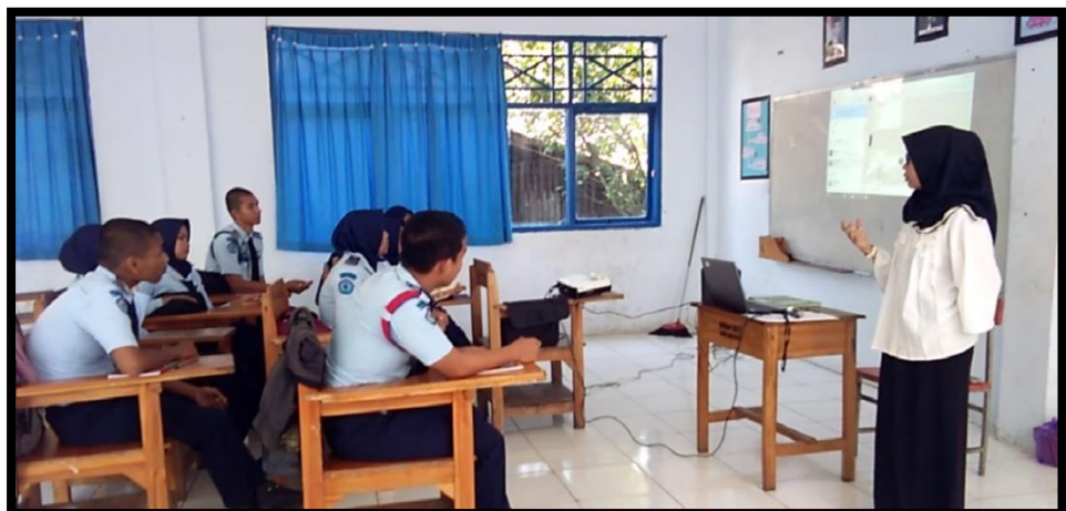
Image 4.6 The English teacher applied WhatsApp in teaching and learning English.

Based on the observation, the researcher found that WhatsApp was one of social media that applied in teaching and learning English.