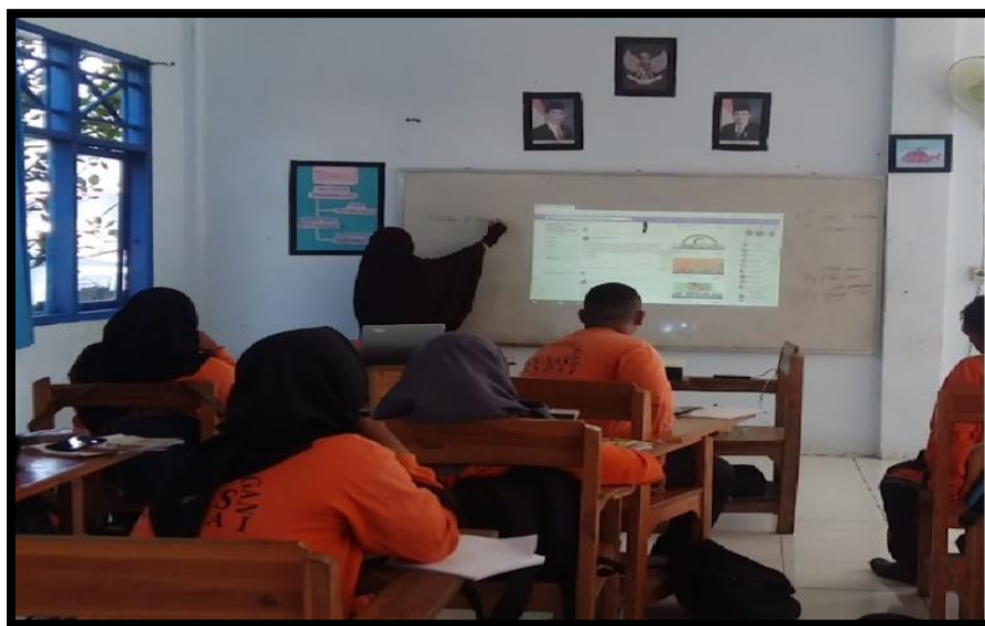
Image 4.1 The English teacher applied a Facebook group in teaching

One of the features of Facebook used is Facebook group to teaching English. it can be identified from image 4.1 below as follows: